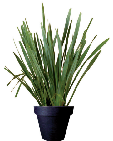
Ref. 112.300 - Phormium ht 1,20/1,50m Ref. 134.359 - Vas three black