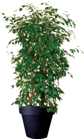
Ref. 113.160 - Ficus ht 1,80/2m Ref. 134.359 - Vas three black