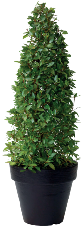
Ref. 112.135 - Bay tree conical ht 1,50m Ø40/50cm Ref. 134.359 - Vas three black

At Gally, we pride ourselves with the reputation of our presentations of both popular and exotic plant selections, presented in standard or tailor-made containers and designed to suit all tastes and decors. The objective is never to clash with or change the existing environment. Our specialists seek to create floral displays that blend with, and enhance, the beauty of the existing colour schemes and atmosphere.