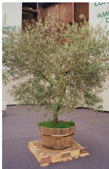
Ref. 122.160 - Olive tree Ø1,50m ht 2,50/3m