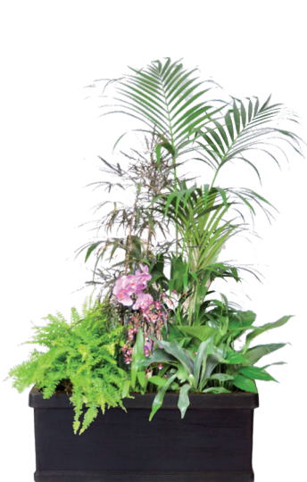
Ref. 143.200 - Black rectangular pot 100 x 32 cm Plants composition