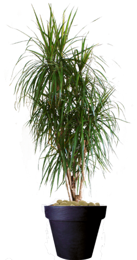
Ref. 113.130 - Dracaena maginata ht 1,80/2m Ref. 134.359 - Vas three black