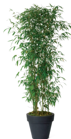
Ref. 111.110 - Bamboo ht 1,50 / 2 m Ref. 134.359 - Black vas three