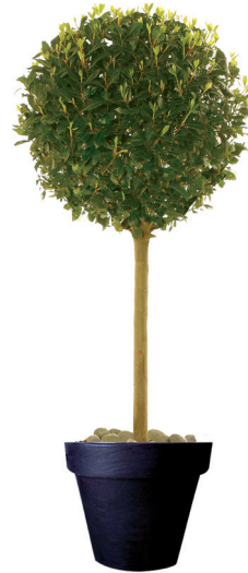
Ref. 112.160 - Bay tree globe ht 1,80m Ø60cm Ref. 134.359 - Vas three black