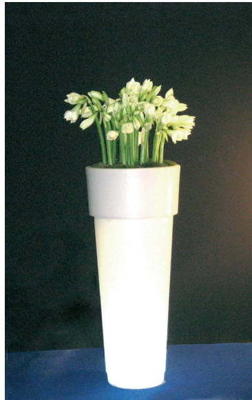
Ref. 134.320 A - Bac Marcantonio light Ø 50 cm ht 1,20 m with white amaryllis

The Gally Design Centre is staffed by knowledgeable and innovative experts who are ready to respond to every customer request. Whether a standard selection or a bespoke solution, our master gardeners guarantee an unsurpassed level of professional advice, project execution and customer satisfaction.