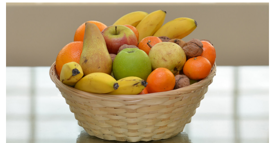
Ref. Pofruit 05K