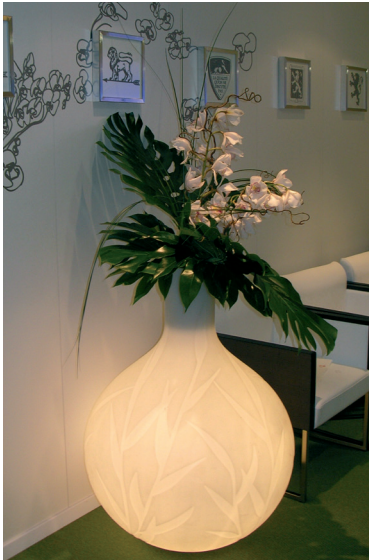
Ref. 134.300B - Princess Light pot Ø 75 cm ht 1 m with Orchids and foliage