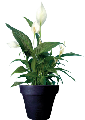
Ref. 113.310 - Spatiphyllum Sensation ht 1,20/1,50m Ref. 134.359 - Vas three black