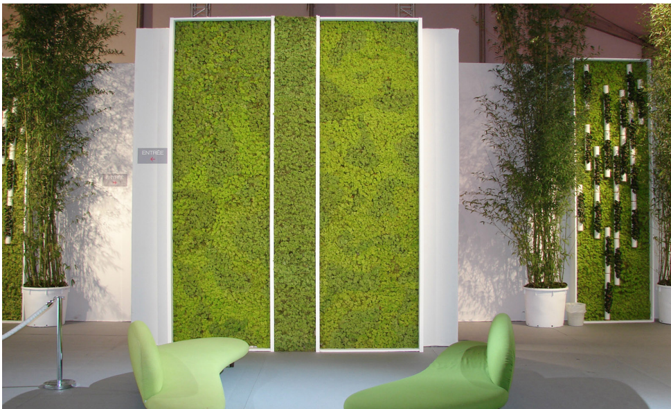
Prices on demand