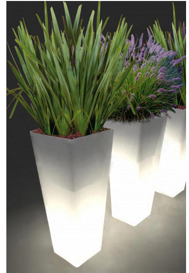
Ref. 134.327 A - PVC Kubis ASQ light 46 x 46 cm ht 1,10 m with Phormiums