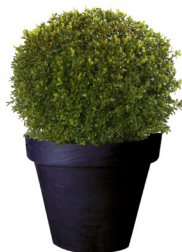
Ref. 111.125 - Box globe Ø35/40 cm ht 0,50m Ref. 134.359 - Vas three black