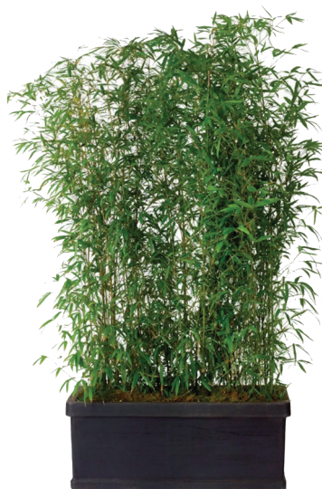
Ref. 142.960 - Black rectangular pot 100 x 32 cm Bamboo hedge ht 2 / 2,50 m