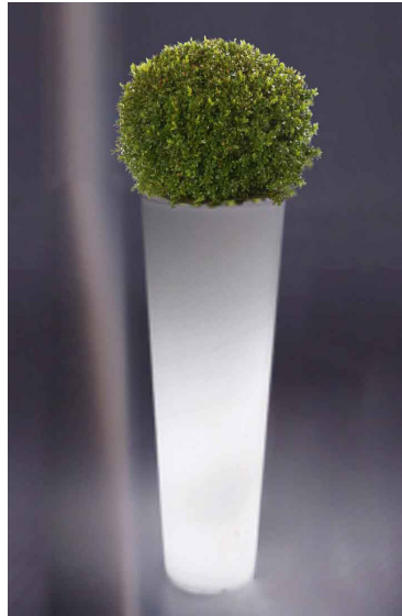
Ref. 134.326 A - PVC New Pot Maxi light Ø 44 cm ht 1,20 m with box globe Ø 45 cm