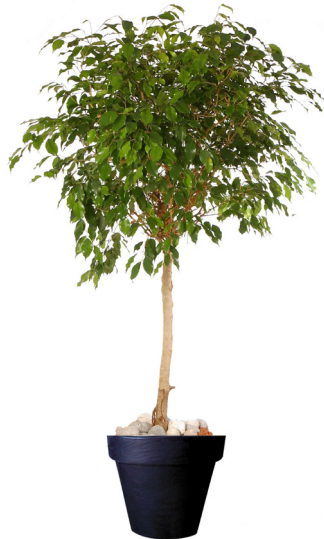
Ref. 123.220 - Ficus globe Ø1,20/1,50m ht 2,50 / 3m Ref. 134.359 - Vas three black