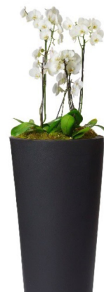
Ref. 113.410 C - Orchids in bac black Partner total ht 1 / 1,10 m