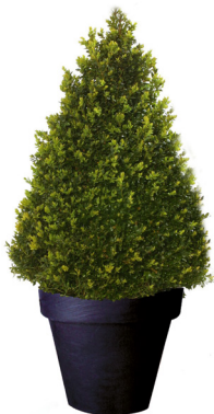
Ref. 111.140 - Box conical Ø50 cm ht 1/1,20m Ref. 134.359 - Vas three black