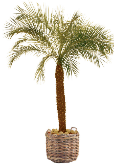
Ref. 113.230 - Phoenix roebelinii ht 1,80 / 2,10 m Ref. 136.300 - Basketwork