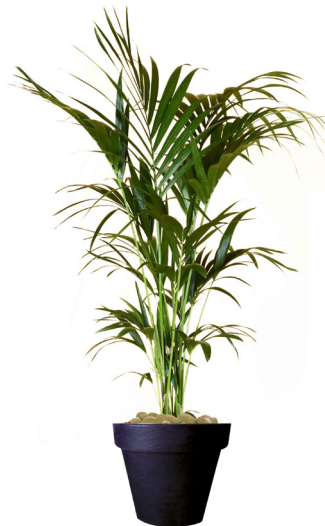
Ref. 113.200 - Kentia ht 1,80/2m Ref. 134.359 - Vas three black