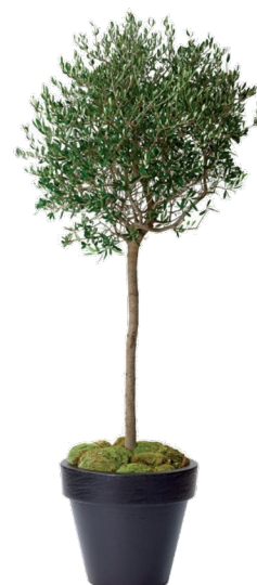
Ref. 112.020 - Olivier Ref. 134.359 - Black vas three