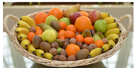
Ref. Pofruit 10K